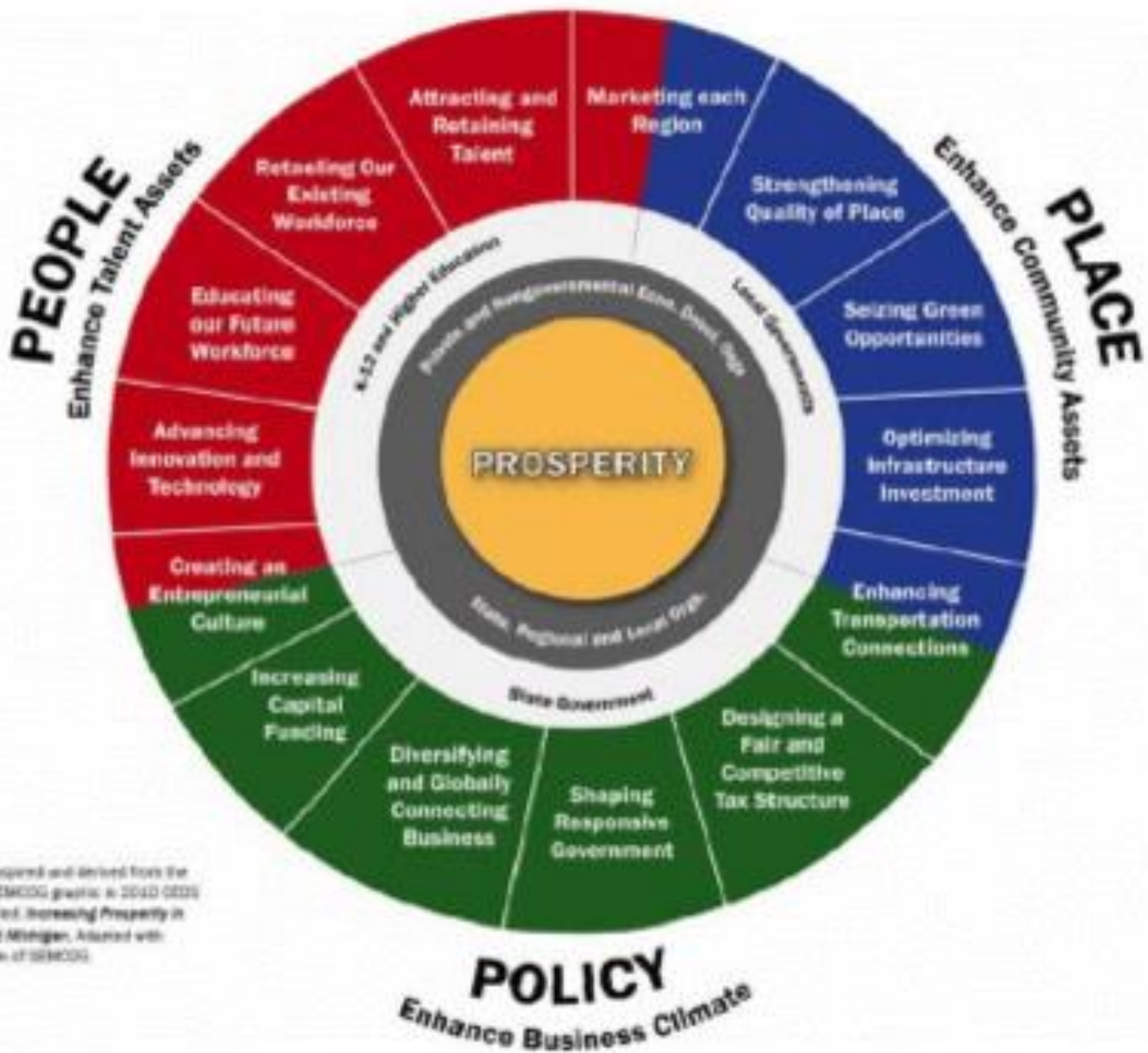
Figure 3 Categories of across-the-board strategies for Michigan to be competitive in the new economy. | Results of a Land Policy Institute Prosperity Initiative for Michigan