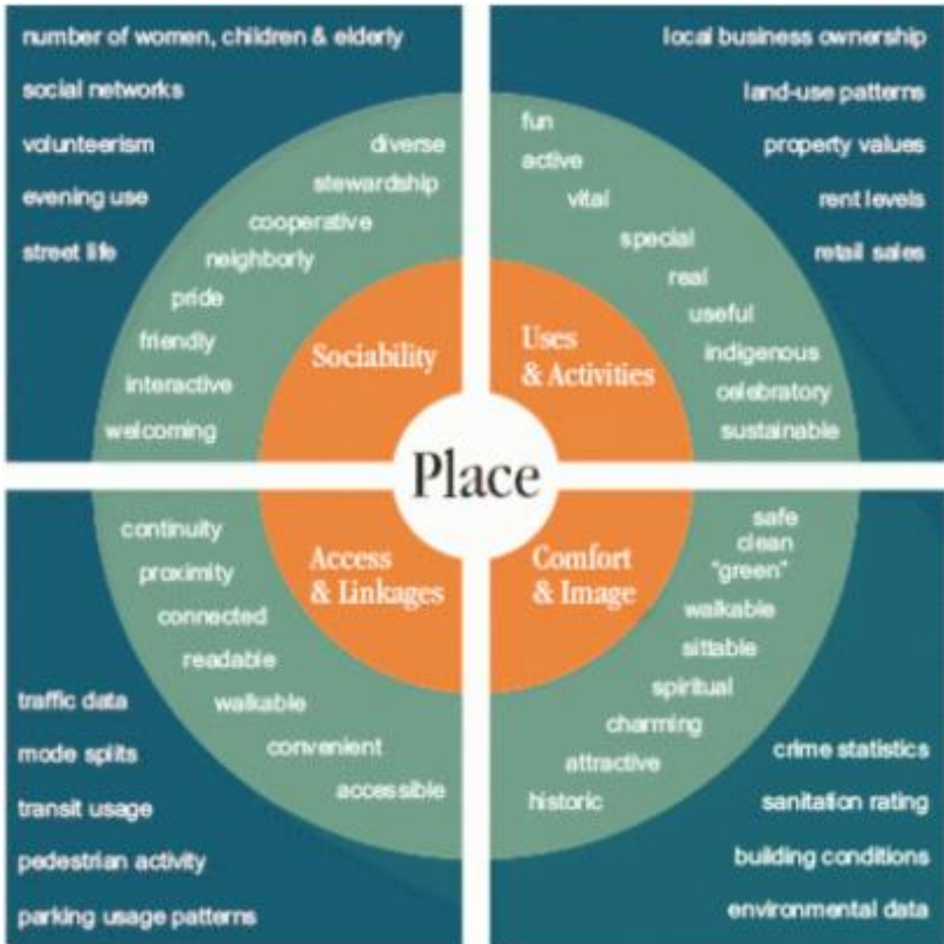
Figure 2: Components of placemaking | Graphic by Glenn Pape of MSU Land Policy Institute from a similar graphic by Project for Public Places, New York.

The most important thing about “quality place” is that each community has its own unique characteristics. Each community has its own set of assets and attributes that are genuine for that community. One should build on those unique assets to enhance and build place.